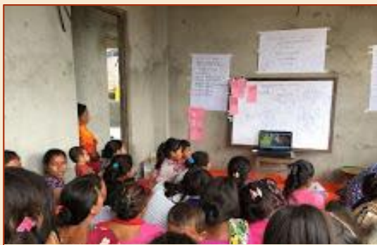
Figure 6 Samll grant activity in Nepal

and 11 women students, the women aged from 14 years to 70 years old. (41 women in total). In this workshop, local women and students got to learn a basic knowledge of gender and sex, the differences between gender equity and gender equality, gender empowerment, women's leadership and a different situation of women in different parts of Nepal.