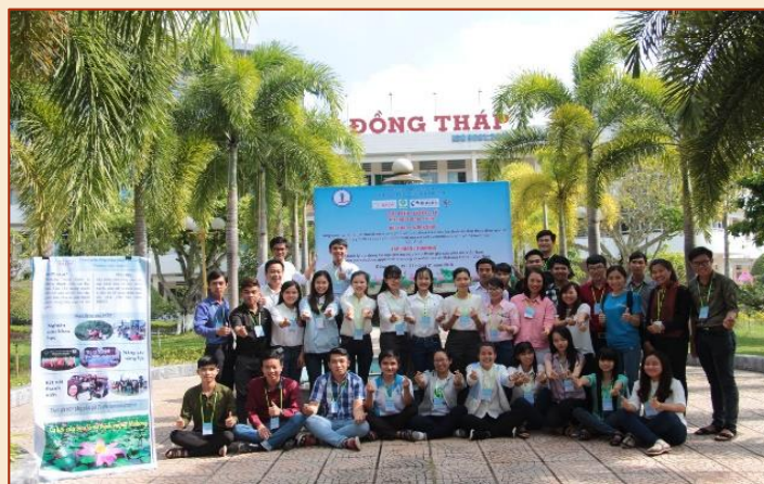
Figure 1 Water Use Gender and Workshop in Cao Lanh city, Vietnam

training in their communities on gender and water issues, and also learned project cycle management skills. The trainers from Vietnam shared their