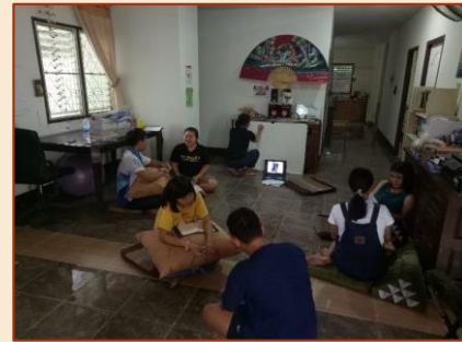
Figure 3 Mekong Youth Assembly Workshop in Chiangmai, Thailand

Salween River. Our staff had increased the understanding of the effects of Salween dams on people around the area, especially minority peoples who do not have Thai nationality.