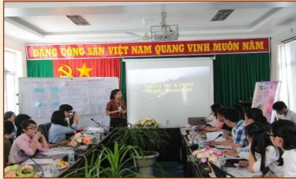
Figure 2 Water Use Gender and Workshop in Cao Lanh city, Vietnam

experiences on gender inequality. For instance, men own more properties than women, men likely have more education than women, and men have more opportunities at school and at work. Specifically, at a young age, women students in the Mekong Delta were forced to stop studying more than men students. The role of women in the family is devalued and their need to do 'double works' without taking salaries, so women become more vulnerable to human trafficking and forced foreign marriages.