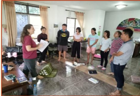
Figure 4 Mekong Youth Assembly Workshop in Chiangmai, Thailand

On October 13th – 15th, 2018, Weaving Bonds' staff joined the Mekong Youth Assembly Workshop in Chiangmai, Thailand. The workshop was organized by the Mekong Youth Assembly (MYA). The objectives are to train Salween youth network participants in understanding how to do research, and to discuss and brainstorm the issues of the